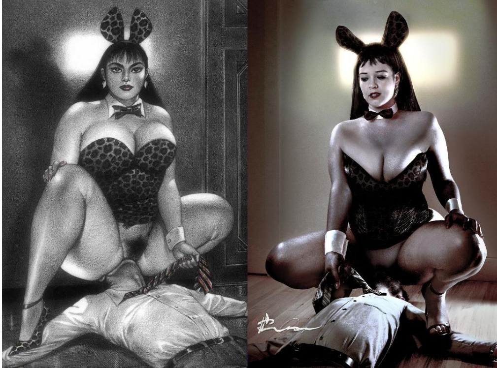
Figure 5. “Namio 2” Namio Harukawa drawing, left. T. Rush photo, right.