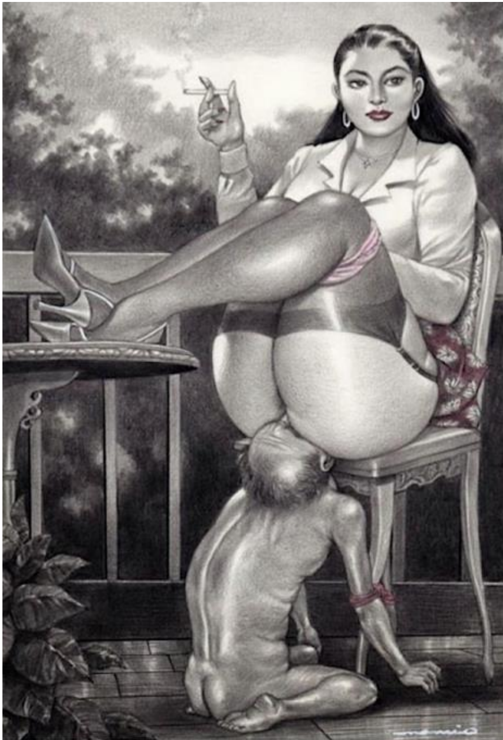
Figure 2. Untitled Namio Harukawa drawing, date of publication unknown