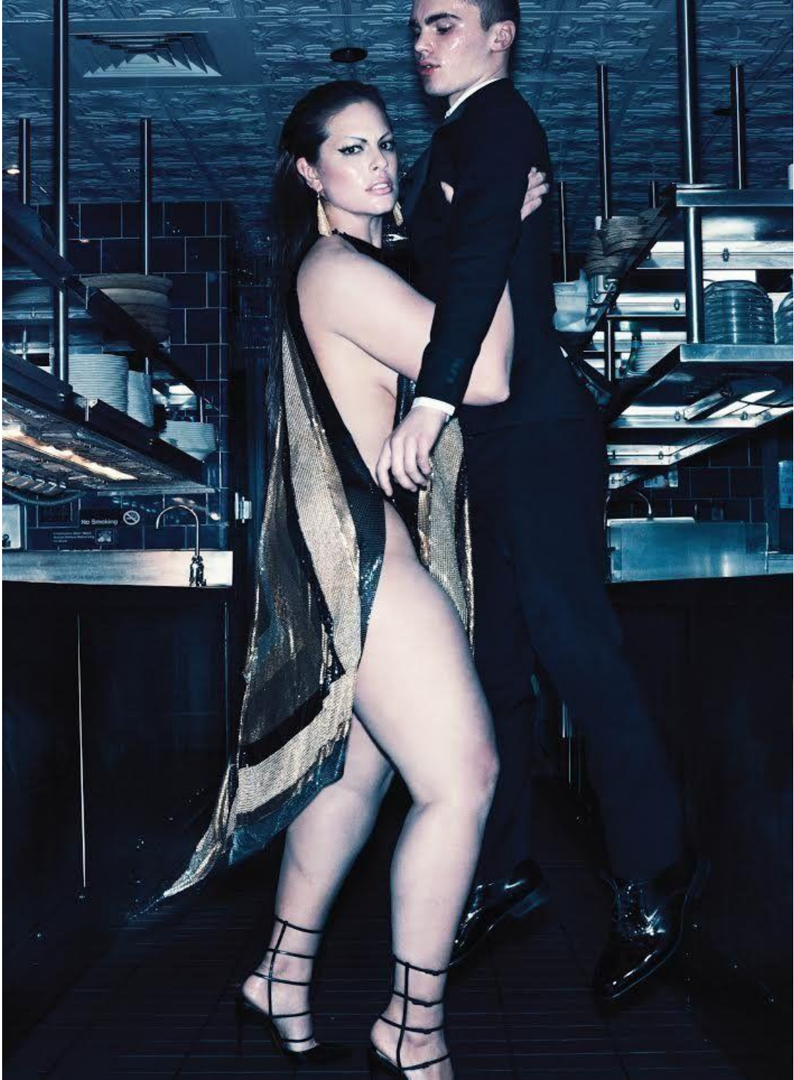
Figure 7. “3” Steven Klein Photoshoot, V Magazine , Jan. 12 th , 2017